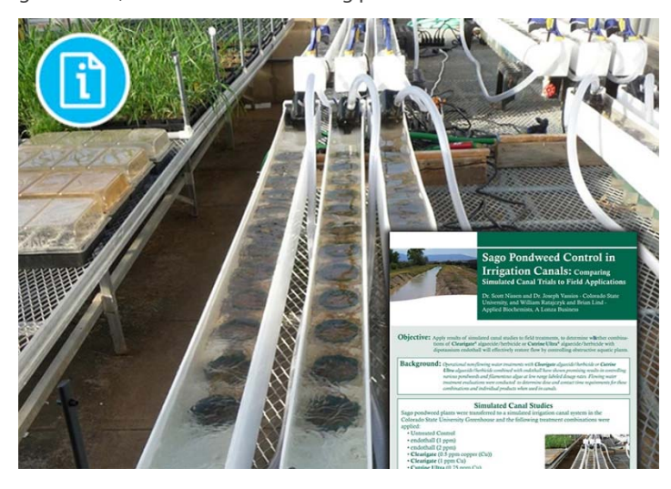
Figure 2. Check out our simulated canal to field study on Sago Pondweed at <a href="https://www.appliedbiochemists.com"><u>www.appliedbiochemists.com</u></a>.