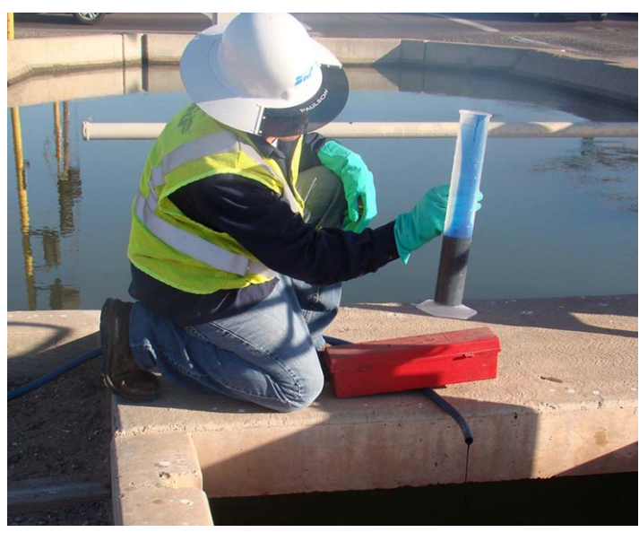
Figure 1. For use in: crop and non-crop irrigation conveyance systems: ditches, canals and laterals; potable water reservoirs; lakes; farm, fish, golf course, industrial and swimming ponds.