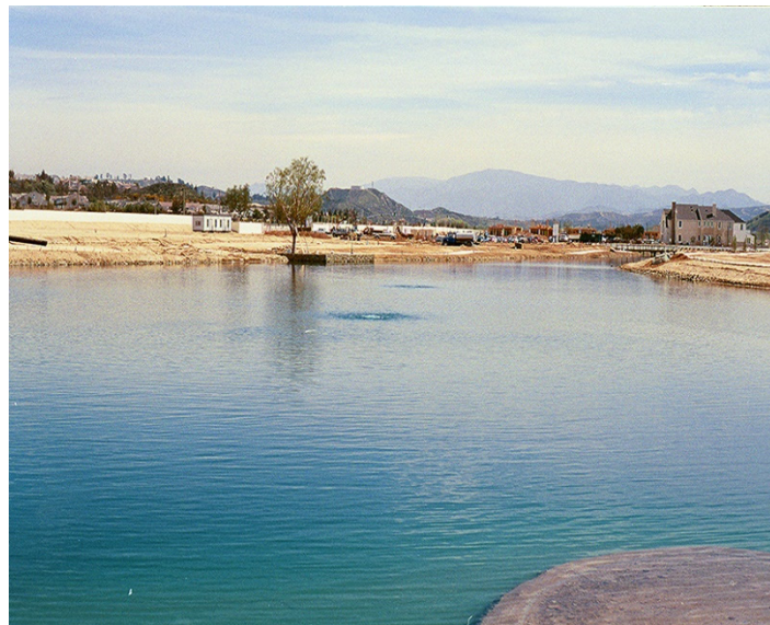
Figure 1. for use in lakes, ponds, and decorative water features with little or no overflow.