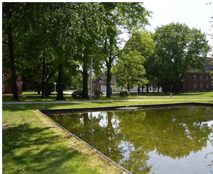
Figure 1. For use in recreational waters to accelerate metabolic nutrient consumption, breaking down organic matter reducing pond "muck".