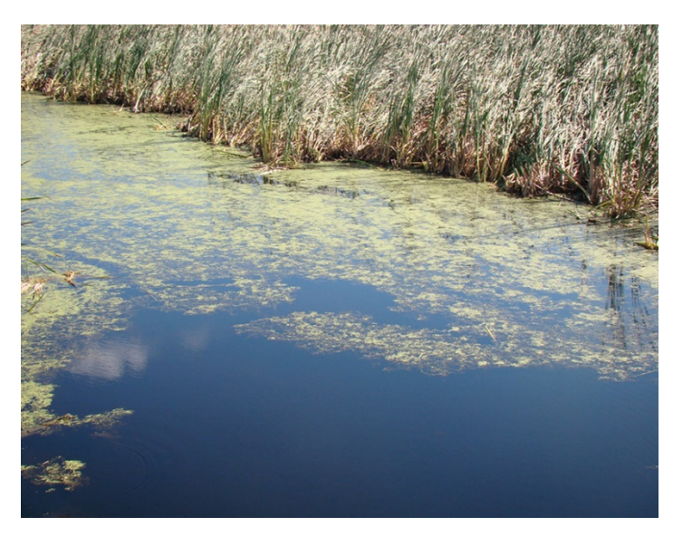
Figure 2. Ideal for controlling nuisance aquatic weeds like duckweed. (Use with aquatic use surfactant.)