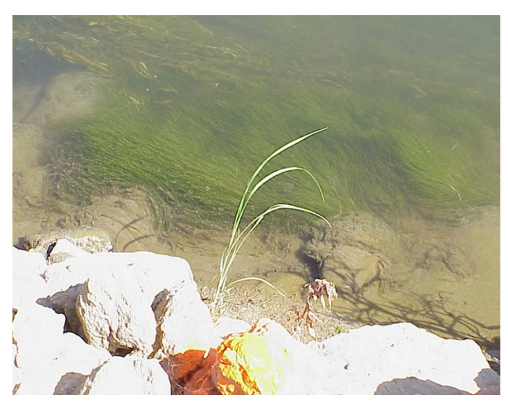
Figure 1. For use in treatment of residential ponds and control of submerged weeds.