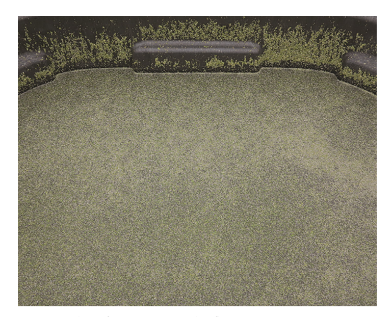
Figure 2. 3 days after treatment with 3 fl. oz. per 1/4 acre