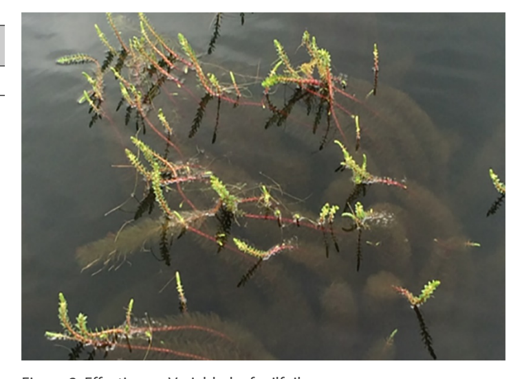
Figure 2. Effective on Variable-leaf milfoil.