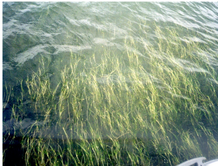
Figure 1. For use in residential ponds or small residential lakes in treatment of underwater weeds.