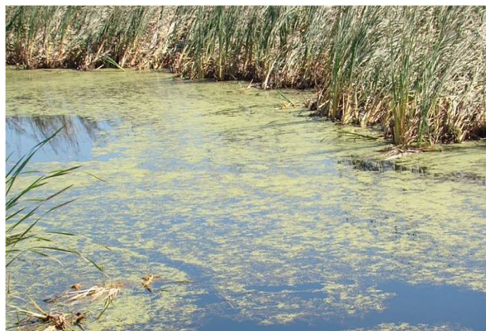
Figure 2. Controls nuisance aquatic weeds like duckweed (use with aquatic use surfactant).