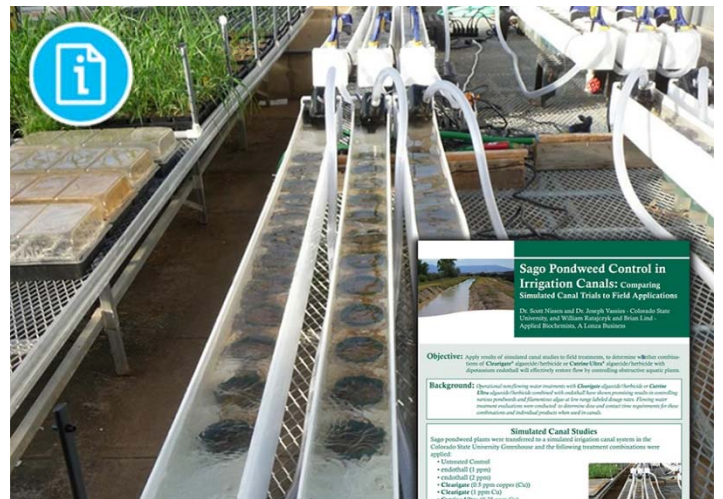
Figure 2. Check out our simulated canal to field study on Sago Pondweed at www.appliedbiochemists.com .