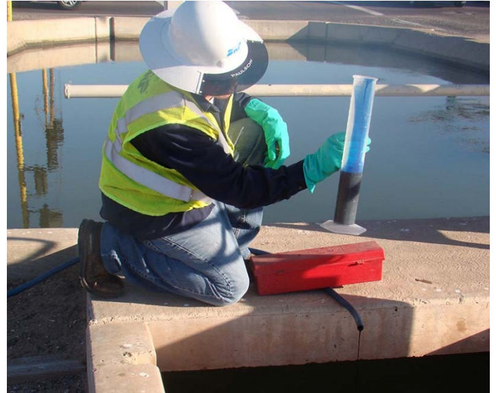
Figure 1. For use in: crop and non-crop irrigation conveyance systems; ditches, canals and laterals; potable water reservoirs; lakes; farm, fish, golf course, industrial and swimming ponds.

All trademarks belong to Innovative Water Care, LLC or its affiliates or to their respective third party owners. The information contained herein is believed to be correct and corresponds to the latest state of scientific and technical knowledge. However, no warranty is made, either expressed or implied, regarding its accuracy or the results to be obtained from the use of such information. Some products may not be available in all markets or for every type of application. Any user must make his own determination and satisfy himself that the products supplied by Innovative Water Care, LLC and the information and recommendations given by Innovative Water Care, LLC are (i) suitable for the user's intended process or purpose, (ii) in compliance with environmental, health and safety regulations, and (iii) will not infringe any third party's intellectual property rights. ©2019 Innovative Water Care, LLC