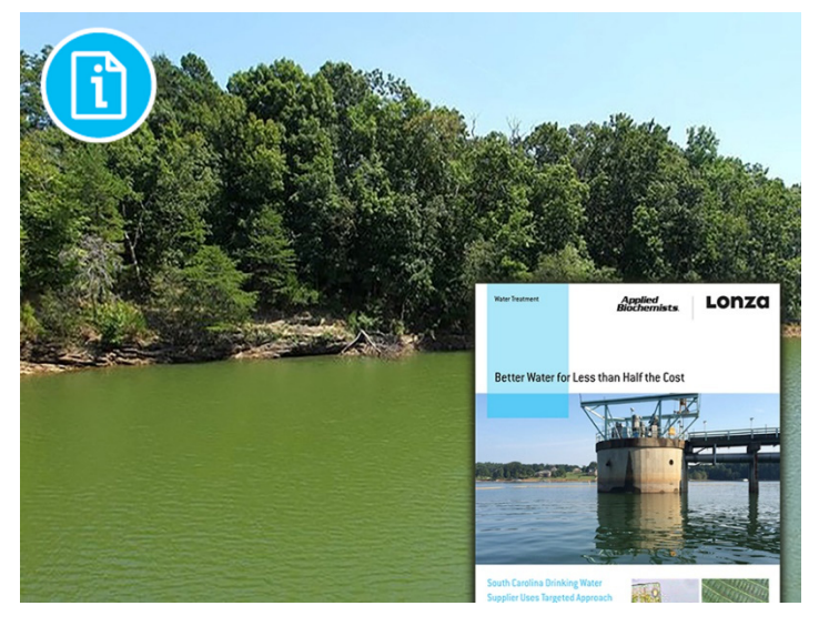
Figure 2. Effective at reducing taste and odor problems associated with algae and cyanobacteria. Check out the Lake Hartwell case study on <u>www.appliedbiochemists.com</u> for more information.

Figure 1. For use in: potable water reservoirs, ponds, lakes, irrigation conveyance systems, ditches, canals, & laterals.